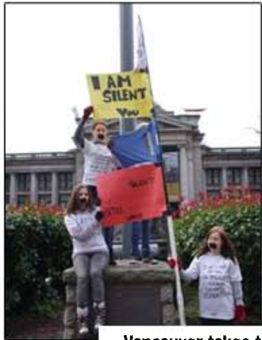
Vancouver takes the Vow of Silence outside the Vancouver Art Gallery