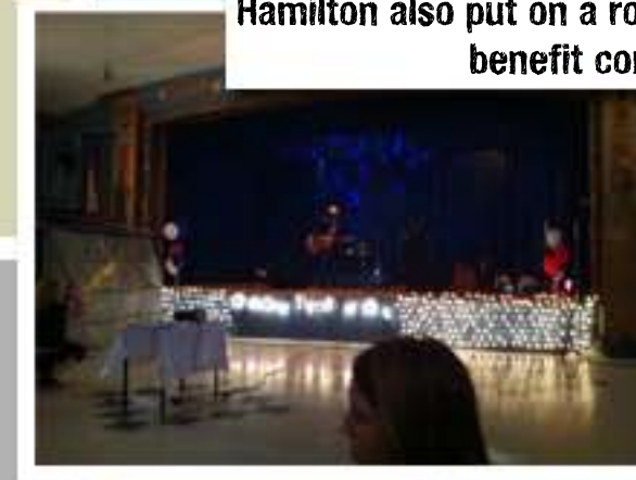
Not to be outdone by Toronto, Hamilton also put on a rockin' benefit concert