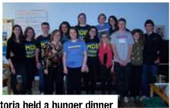
Victoria held a hunger dinner with federal Green Party Leader and MP Elizabeth May.