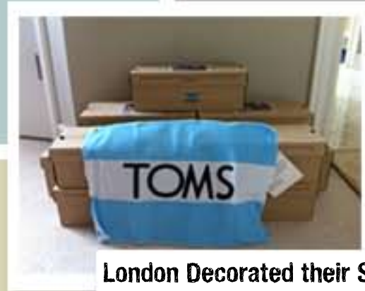
London Decorated their Soles in conjunction with TOMS shoes