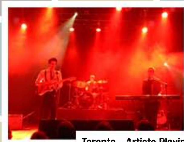
Toronto - Artists Playing For Change at Massey Hall.