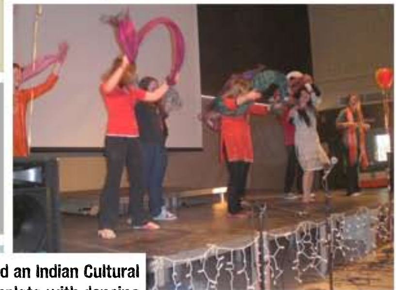
Muskoka held an Indian Cultural Evening, complete with dancing and delicious Indian food.