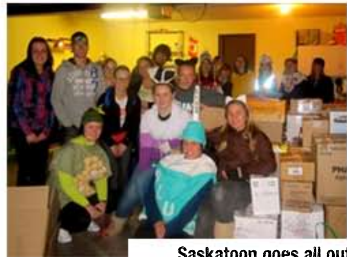
Saskatoon goes all out for Halloween for Hunger, collecting 5434 pounds of food.