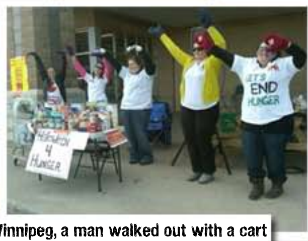
In Winnipeg, a man walked out with a cart full of food. He took one can out, and pushed the cart towards the MOB. He donated the entire cart for their food drive!